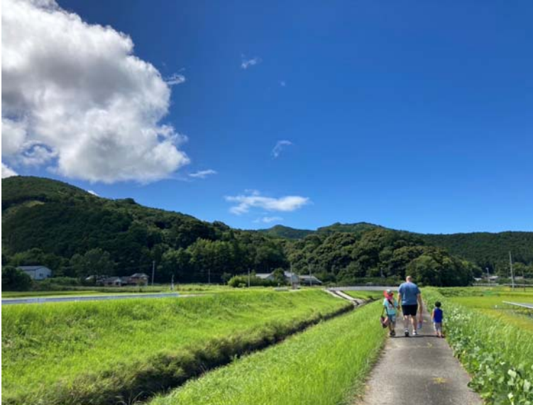
Out for a walk with boys from the Family Home.

Thank you for your prayers! We arrived back in Japan in the middle of July and hit the ground running. Thank you everyone for praying for our safe travels. We had a bit of a hiccup when we got back to Tanabe and found that both of our cars were dead. Thankfully, with a loaner and a rental car, we were able to make things work until we had our own wheels back. The house was mostly turn-key, as we left it ready to go when we visited back in January.