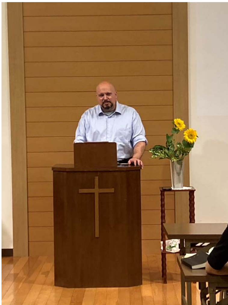
Preaching at Mihama

continue to guide us in this process--we remain open to adoption, but are praying that God might give us one or more additional children biologically.